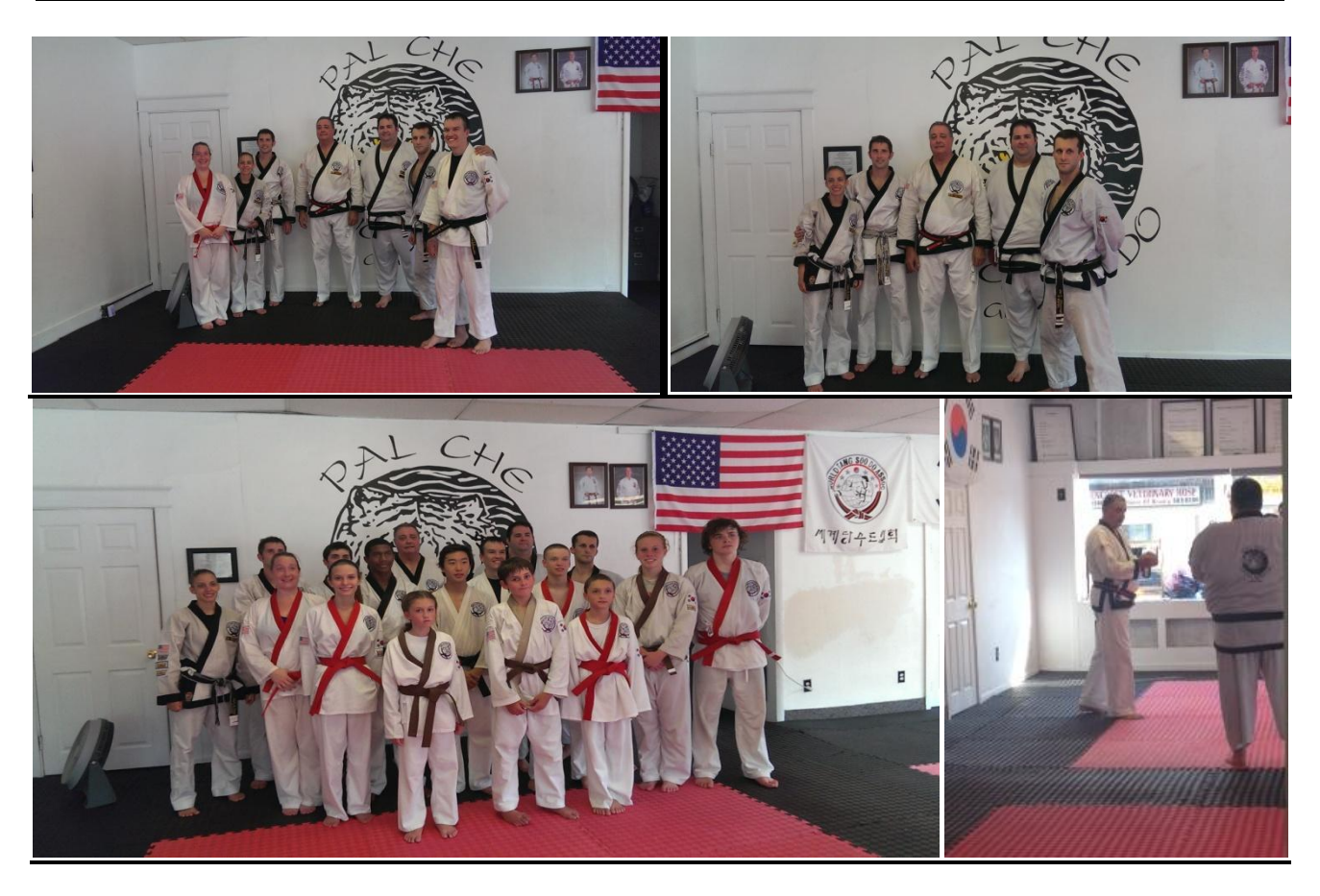
2013 Region 8 Color Belt (Gup) Clinic – Saturday, August 10<sup>th</sup>, 2013